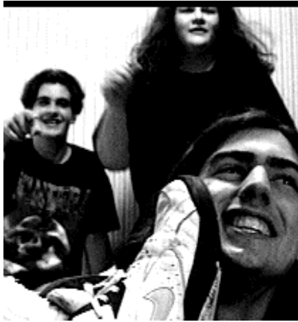
Raucous Display of Moron