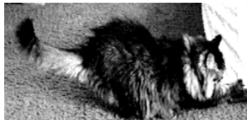
Figure 9-7: "A Cat"